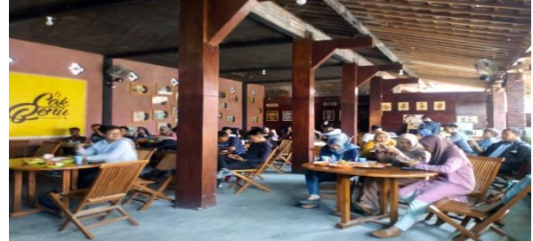
Pict 1 Migrant workers candidate in this public services

Community service was held offline on Wednesday, January 5, 2022 by inviting prospective migrant workers to attend this legal counseling event considering the opportunities for migrant workers to reopen after several years of being suspended due to Covid 19. The counseling was attended by 27 prospective migrant workers from the Ponorogo district.