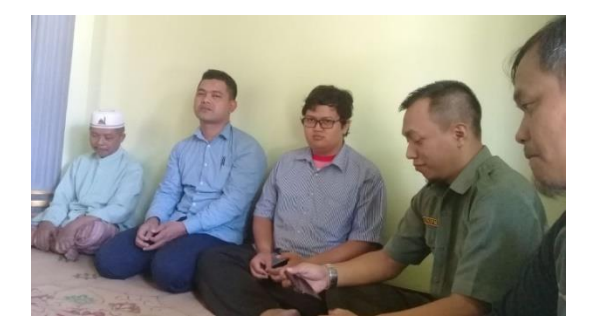
Pict 3 Committee and discussion with officials from district